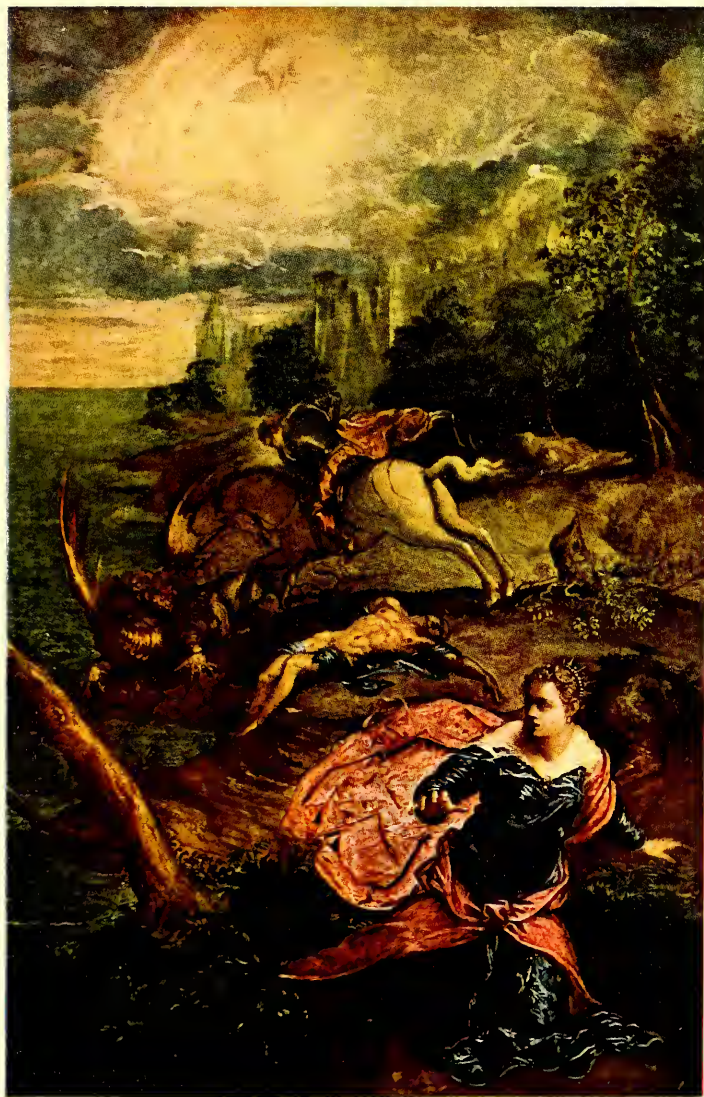
ST. GEORGE DESTROYING THE DRAGON.

From the picture by Tintoretto, in the National Gallery, London.